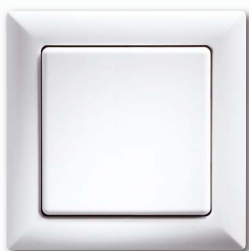
Wireless pushbutton with rocker

Starkt kitt bryteren kommer med enkel vippe.